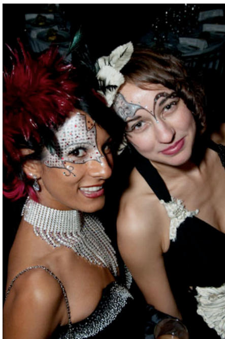
I can't resist a masked ball, and neither could these two lovelies.